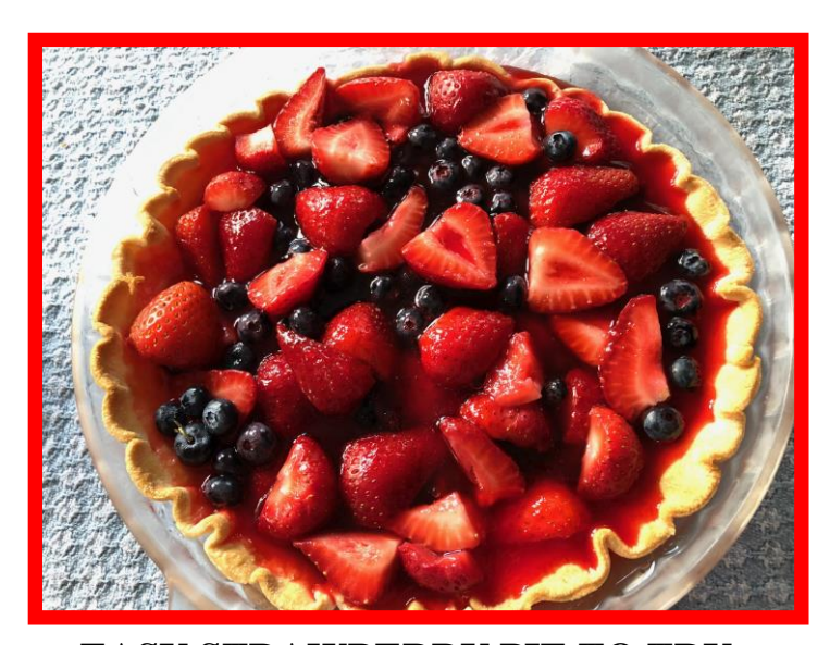
EASY STRAWBERRY PIE TO TRY (in case you're missing the annual Strawberry Social)

Mark your calendars for June 12, 2021. Old Zion's Strawberry Social will be back and better than ever next year.